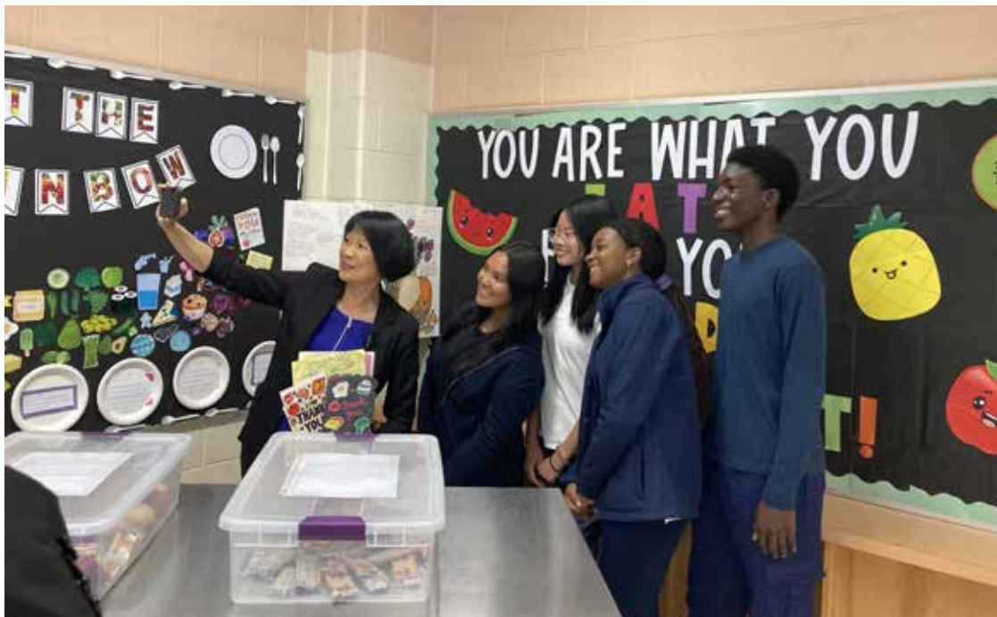
Mayor Chow enjoys a moment with students from The Divine Infant.