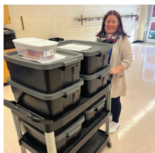
SNP Coordinator at The Divine Infant delivering morning snacks

We look forward to working with you in the months ahead.