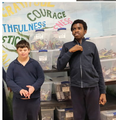
Student helpers at Venerable John Merlini enjoy taking snacks to classes