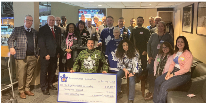
Great to celebrate the school day game with so many of our corporate sponsors, TCDSB leaders and other education partners.