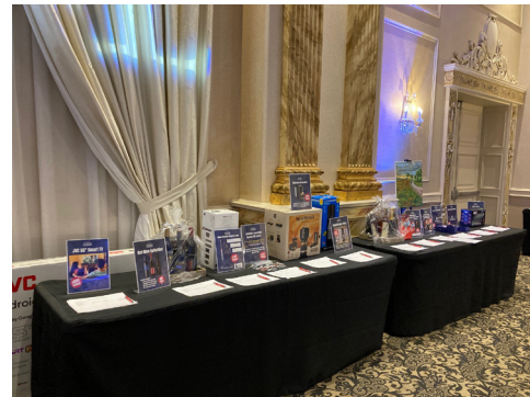
Registration area (left) and a portion of our silent auction (right).